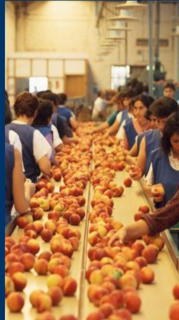
Women employees at a Chilean peach processing plant