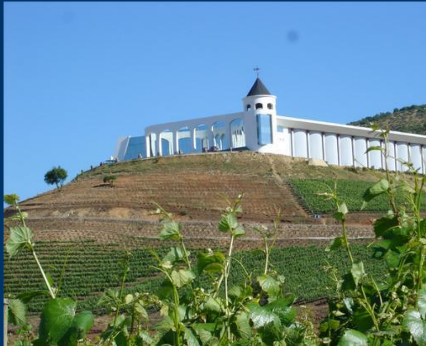
Indomita winery, Casablanca

To gain a greater understanding of how further land concentration, encouraged by neoliberal policy, has affected vulnerable labour groups in rural Chile, with specific focus on employees of large wine producers