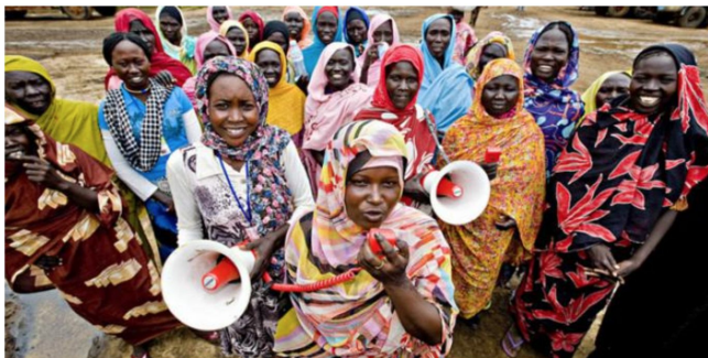
Oxfam 2020 - Why the International Secretariat must move south