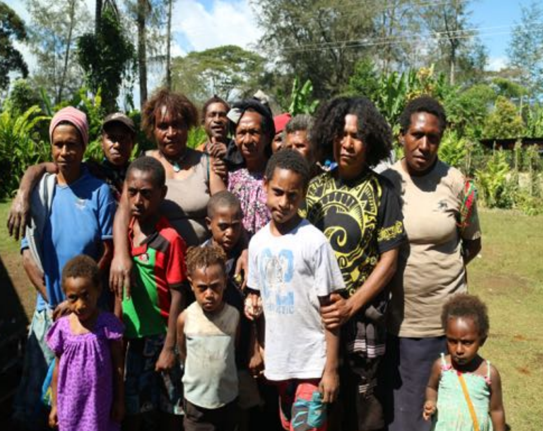
Female entrepreneur with hired labourers and family members