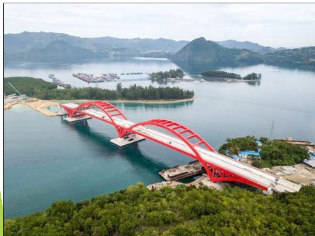
New construction of Youtefa Bridge