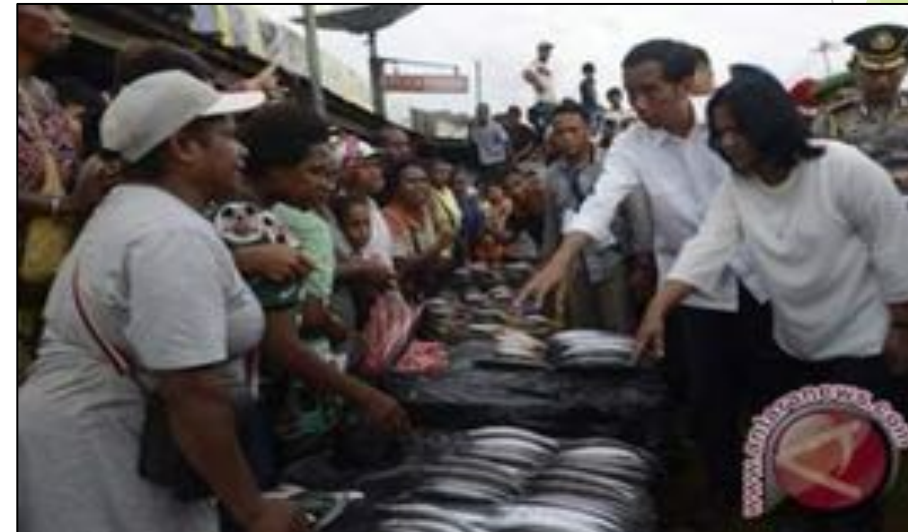
Jokowi, at the Papuan Markets