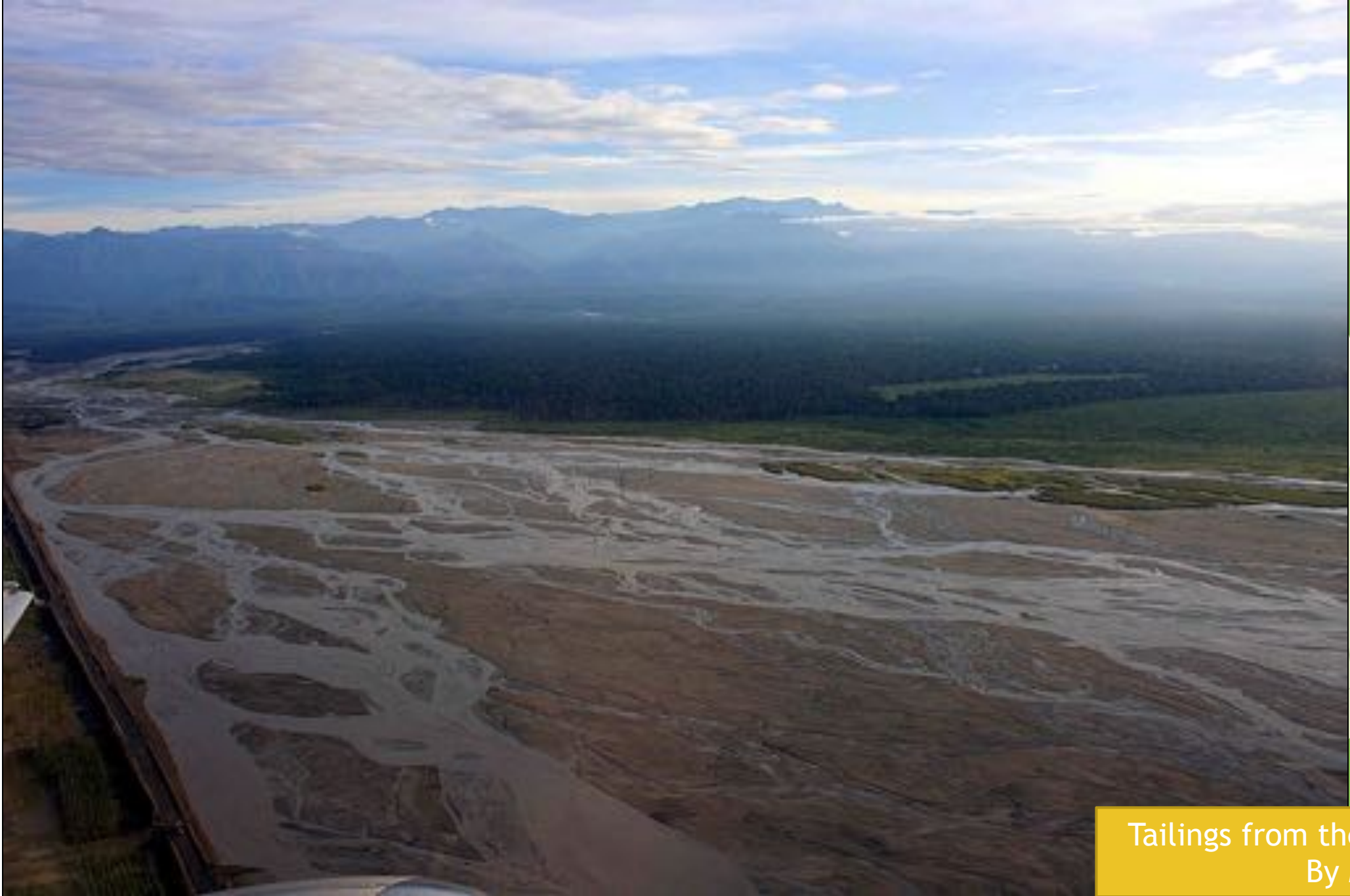
Tailings from the Grasberg Mine