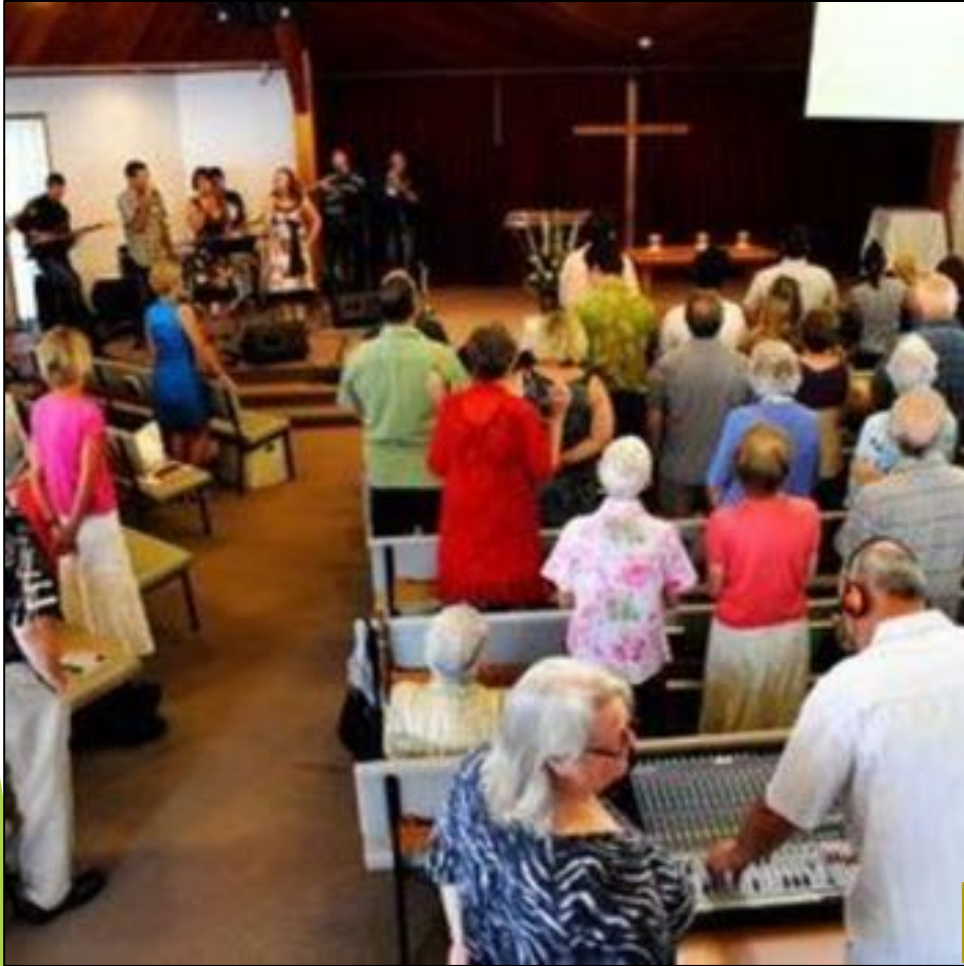
Mt Roskill Baptist