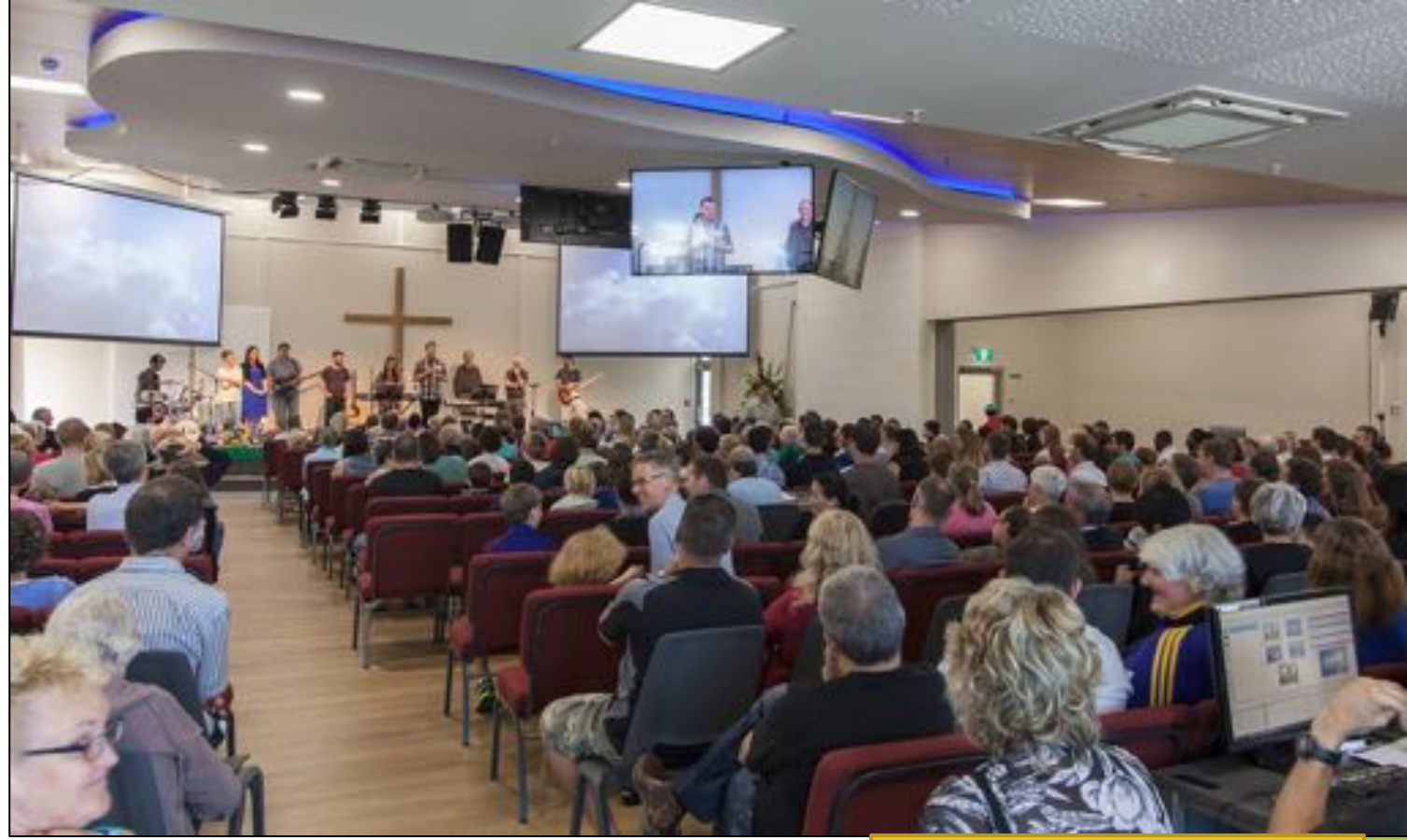
Dunedin City Baptist

240 churches in the Baptist Union, approx. 53,000 New Zealanders identify as Baptists.