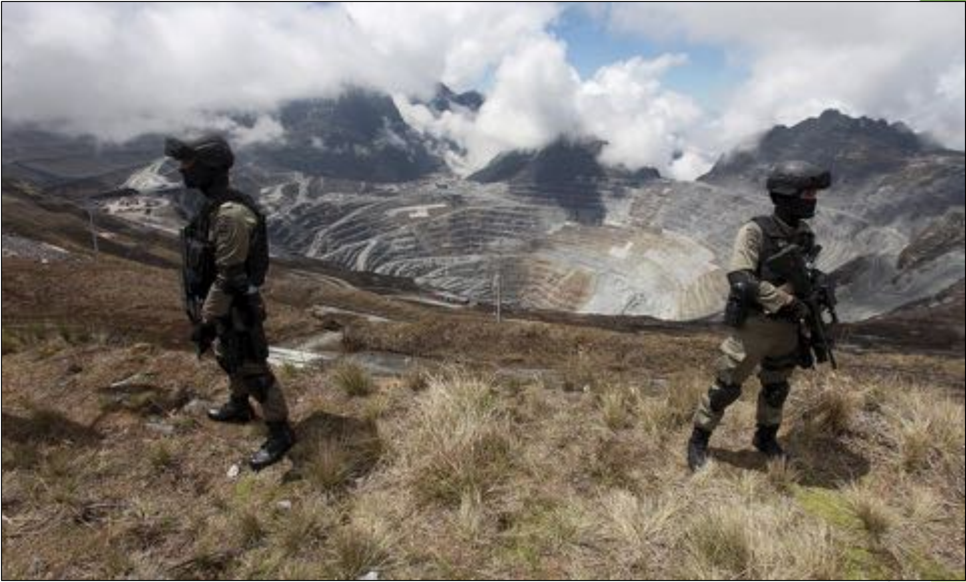
McMoRan Mine