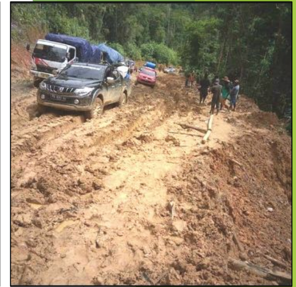
First time ever new highway, from Jayapura to Wamena