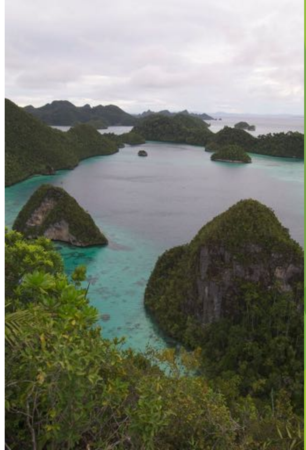
Wayag Island, Raja Ampat